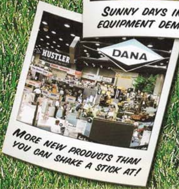
MORE NEW PRODUCTS THAN YOU CAN SHAKE A STICK AT!