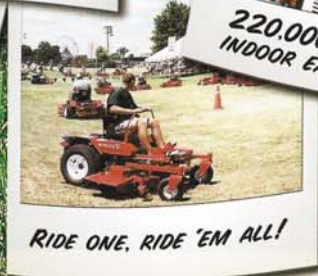
RIDE ONE. RIDE 'EM ALL!