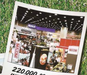
220,000 SQ. FT. OF INDOOR EXHIBIT SPACE