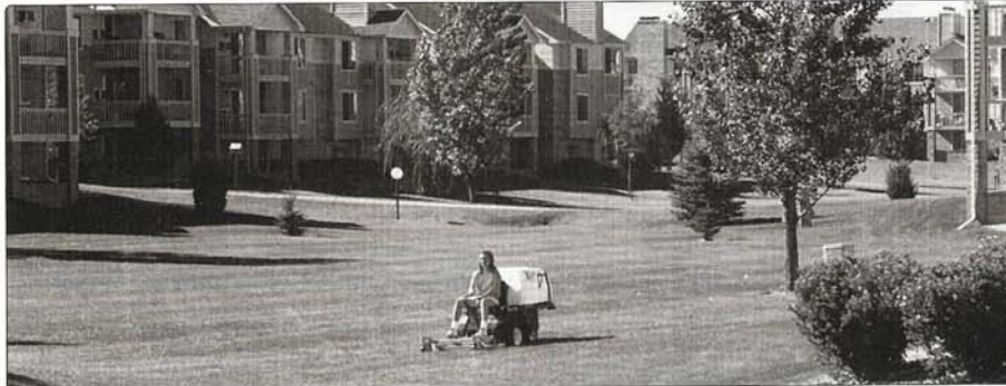
Fitch Fuel Catalyst improves starting, fuel economy and power while reducing smoke, plug fouling and emissions.

FFC comes in a variety of sizes and is suitable not just for power equipment, but also cars, trucks and boats—almost anything with an engine. In fact, dealers have had success selling the automotive size after their customers see how well the catalyst works in their power equipment. "So the dealer makes not only the initial sale, but he makes another bigger sale, which is a profit for him," explains Wright. PET