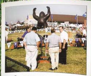
SUNNY DAYS IN THE EQUIPMENT DEMO AREA